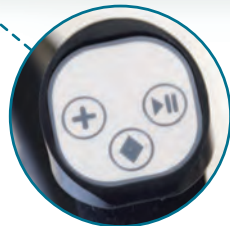
Independently-adjustable handlebars with programmable buttons