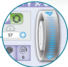
On-screen hand wheel

Twenty-four inches of quilting possibilities.