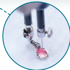
Pinpoint needle laser