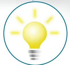
QuiltMaster™ LED lighting: throat, needle, and bobbin