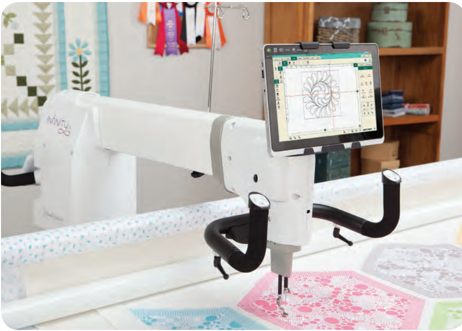
Pro-Stitcher Premium shown on the HQ Infinity.